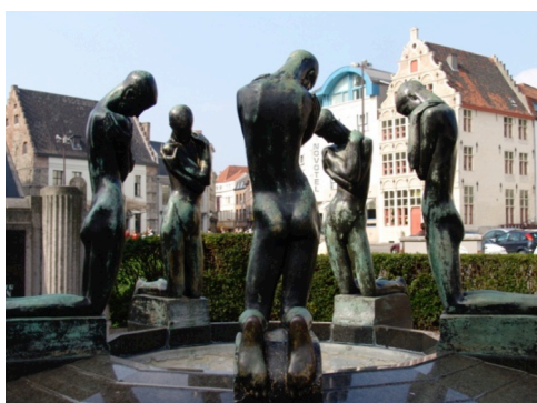
Ghent city, Belgium

A major conflict mediation event will be held in Ghent, Belgium, on Wednesday 1 October, with the theme: